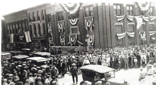
STARK BROS NURSERIES AND ORCHARDS CO., OFFICES LOUISIANA, MO.

A combined project of the Louisiana Public Library, Louisiana Historic Preservation Association, Louisiana Historic Preservation Commission, and Louisiana Area Historic Museum to digitize pictures and documents of Louisiana's past.